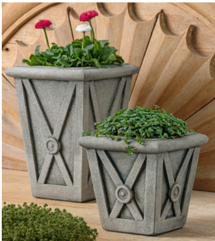
P-920 and P-919 shown in Alpine Stone