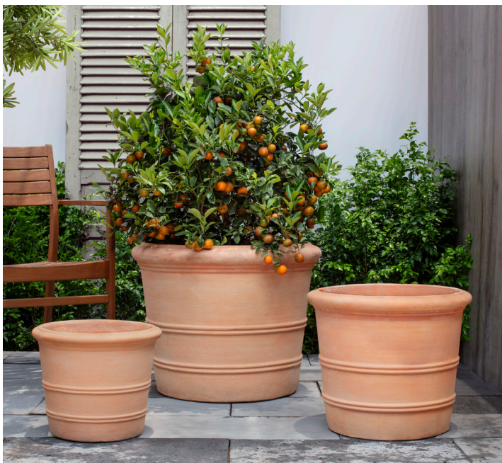
Shown in Terra Cotta