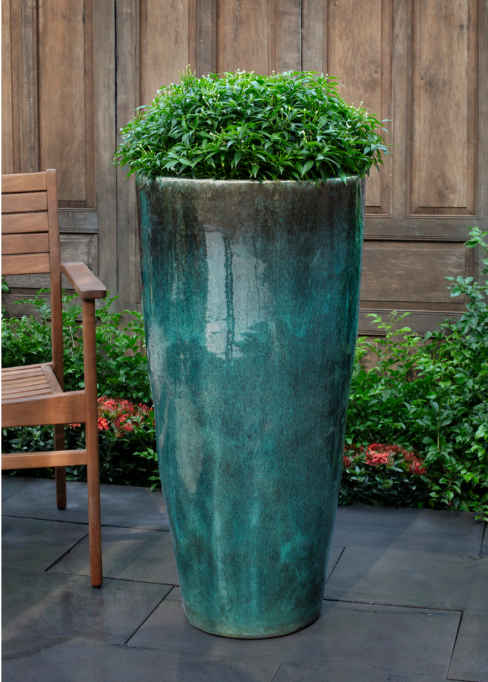
Shown in Antique Jade